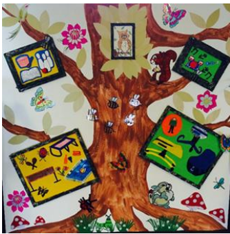
West Wing Tree of Support