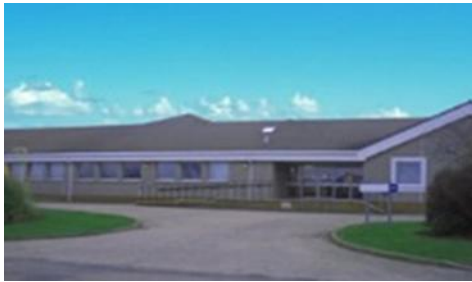
Car parking and easy access

Within the Resource centre people can receive: